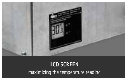
LCD SCREEN maximizing the temperature reading