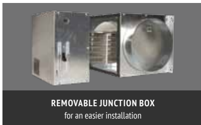
REMOVABLE JUNCTION BOX for an easier installation

5 years for the elements and 1 year for other components