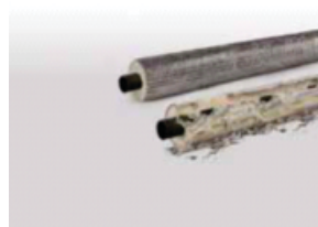
AFTER 3 YEARS