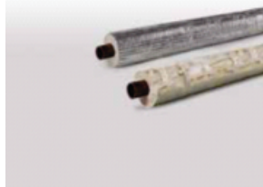
AFTER 2 YEARS