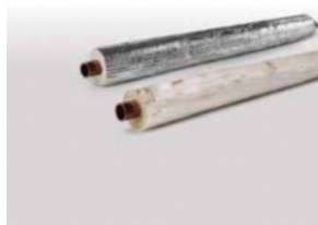
AFTER 1 YEAR